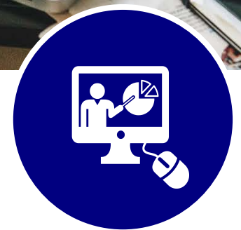
Online and customised courses

Data lies at the heart of your organisation and its effective use is vital for operational efficiency and competitiveness.